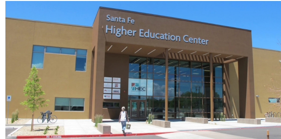
SANTE FE CENTER

Serving approximately 2,700 total students, evenly distributed between residential, commuter and online, the University offers 29 bachelor's degree and 31 master's degree options spread across four colleges and schools: Facundo Valdez School of Social Work; School of Business, Media and Technology; School of Education; and College of Arts and