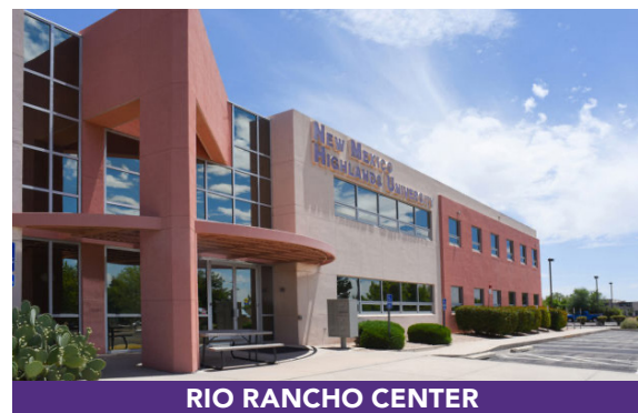
RIO RANCHO CENTER

Sciences. With its online programs having experienced significant growth, NMHU stands out for its accessibility and flexibility in delivery, effectively serving students of all types. The student-faculty ratio is 15-1.