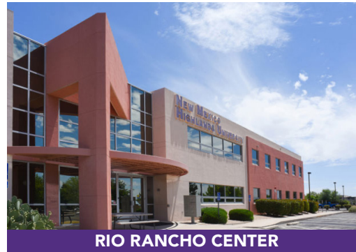
RIO RANCHO CENTER