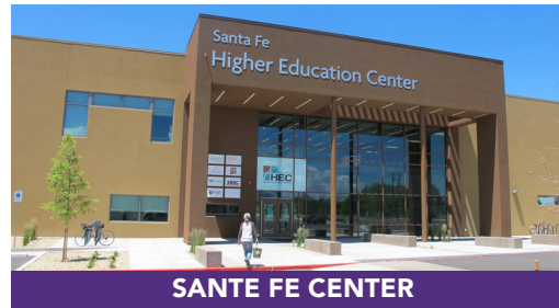
SANTE FE CENTER

Serving approximately 2,700 total students , evenly distributed between residential, commuter and online, the University offers 29 bachelor's degree and 31 master's degree options spread out across four colleges and schools: Facundo Valdez School of Social Work; School of Business, Media and Technology; School of Education; and College of Arts and Sciences. With its online programs having experienced significant growth, NMHU stands out for its accessibility and flexibility in delivery, effectively serving students of all types. The student-faculty ratio is 15-1 .